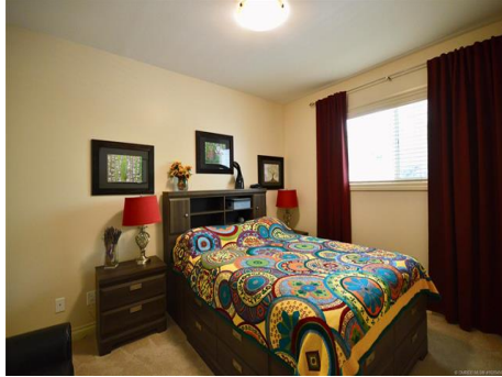
Information Deemed Reliable But Cannot Be Guaranteed.